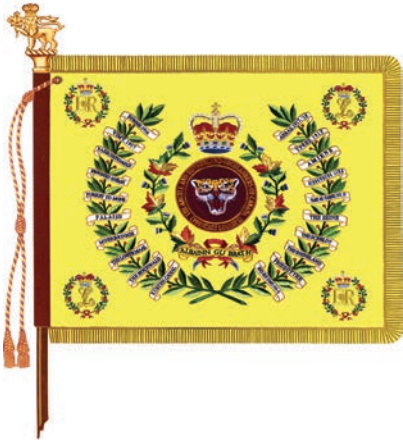
The fourth Regimental Colour, 2002.