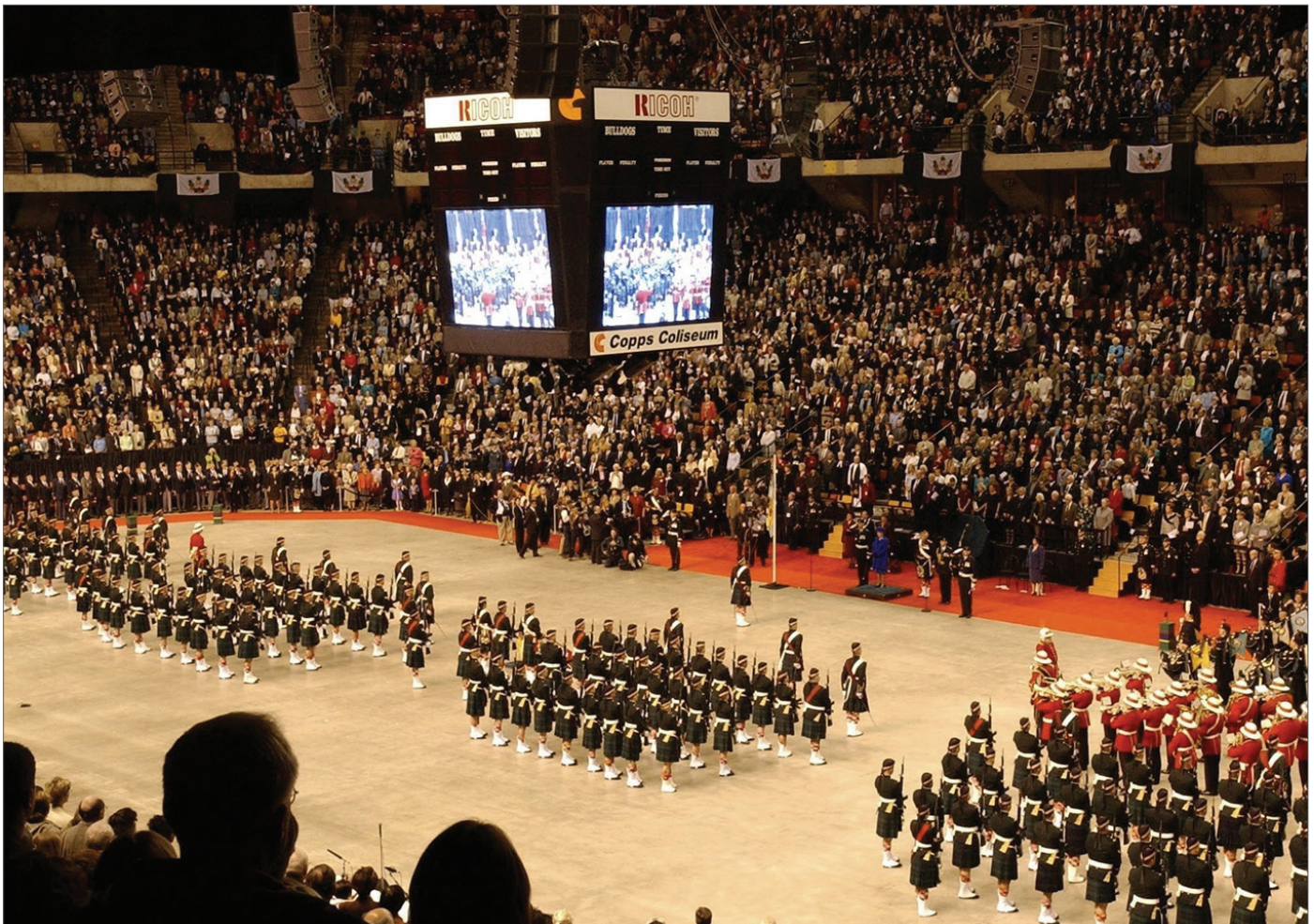
The presentation of the Regiment's 4th set of Colours by Her Majesty, Queen Elizabeth II, our Colonel-in-Chief, 10 Oct. 2002. Copps Coliseum.