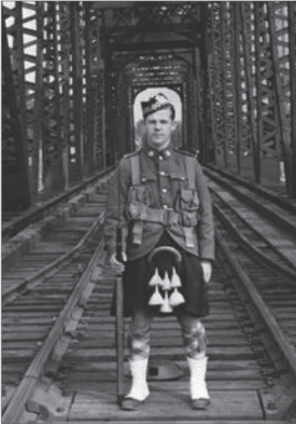
On guard at the railway bridge over the Burlington Bay Canal, 1940.

The 1st Battalion, Argyll and Sutherland Highlanders were mobilized in 1940 for overseas service; a 2nd Battalion remained in Hamilton.