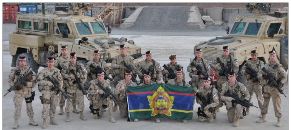
Argyll soldiers of the Provincial Reconstruction Team, Afghanistan, 2009.

The Argyll Regimental Foundation was established in 1980 to preserve the Highland traditions of the Regiment. The first campaign raised over $200,000 to provide an endowment for perpetuating Highland dress; the second (2001-02) raised over $1,000,000 to recognize the Regiment's 100th anniversary and to build a memorial, the Argyll Commemorative Pavilion, in Hamilton's Bay Front Park. The third campaign has several goals, all of which cover projects and expenditures not covered by the federal government: increasing the endowment that supports annual expenses on Highland dress; publishing a history of the Regiment's First World War Battalion; erecting four monuments in France and Belgium representing the 19th Battalion's sacrifice; restoring the 1921 WWI monument at the John Foote Armouries; and reoutfitting the Pipes and Drums, which have provided this country and this community with two of its most iconic images of this nation at war.