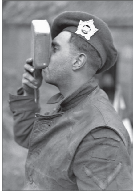
A weary Argyll eating after the battle at Veen, Germany, 7 March 1945.